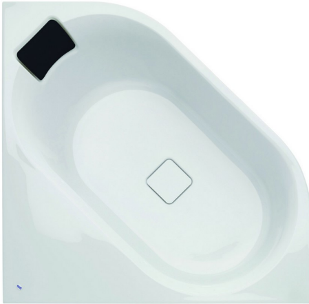
65510 / 65550